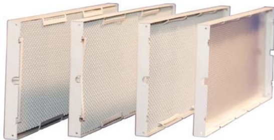
Two-lamp fixture screens

Note: White-finish screen with off-white frame standard; custom-finish screen optional (add -CF suffix to Part Number)