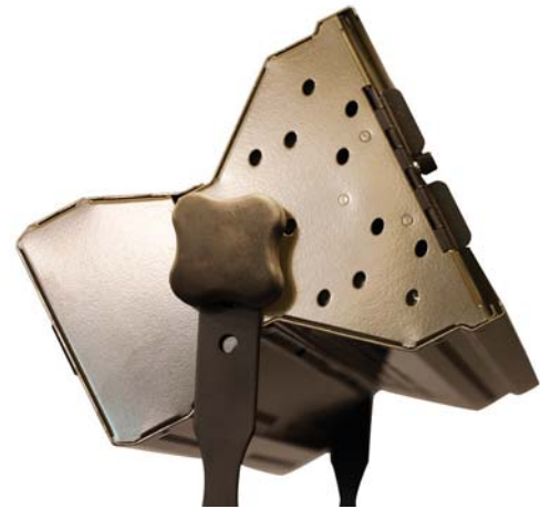
Profile of SeriesONE Fixture with Double Accessory Track