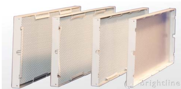
Two-lamp fixture screens

Note: White-finish screen with off-white frame standard; custom-finish screen optional (add -CF suffix to Part Number)