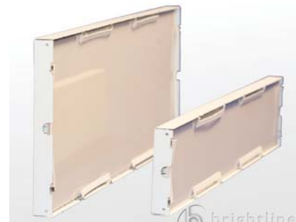
Fixture screens with Glare-Reduction Filter